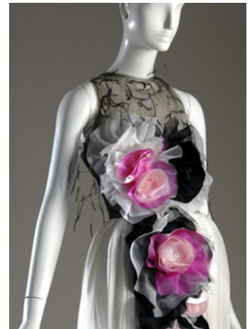
Dress White organza, silk tulle, and feathers Rodarte, Spring 2007 The Museum at FIT, 2007.13.1