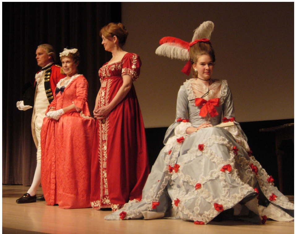
Above: fashion show by Colonial Williamsburg interpreters; Top and bottom left: A livery costume and an embroidered silk dress in the Williamsburg costume shop—in progress.