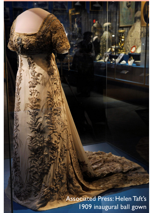
Helen Taft's 1909 inaugural ball gown