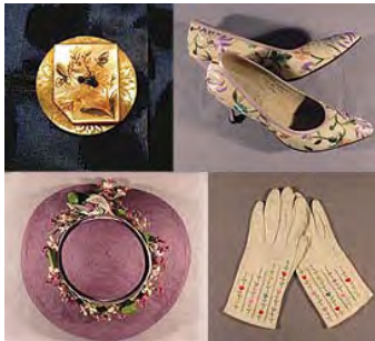
(Examples of Flora in Fashion , image copied from website)

For more information visit: http://costume.osu.edu/exhibitions/flora-in-fashion/