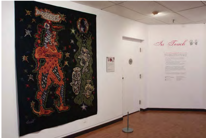
(Installation view, copied from exhibition website)