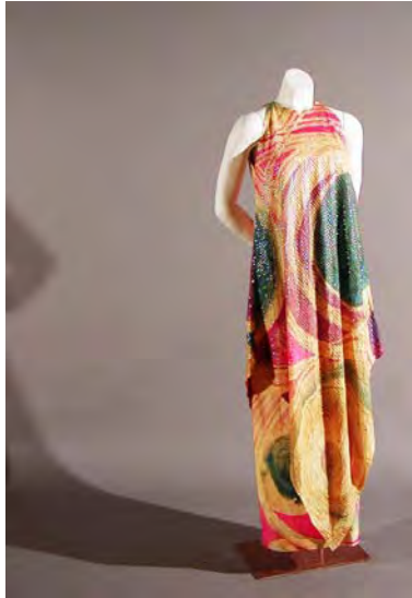
(Oscar de la Renta, evening gown, 1970, silk batik and sequins)